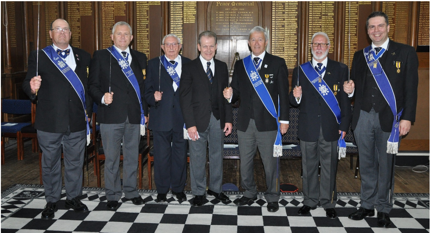
Among the many guests were Heads of several Surrey Orders, and distinguished guests from other Provinces.

The Provincial Grand Supreme Ruler's Arch of Steel were busy rehearsing their duties in the Temple.