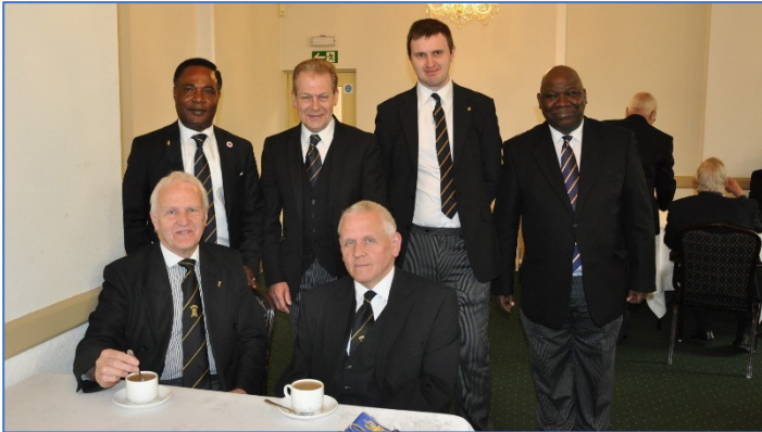
The Brethren of Surrey and their guests started arriving from 9 am where coffee and bacon sandwiches were being served in one of the dining rooms.

The Annual Meeting of the Provincial Grand Conclave of Surrey was held at the Surbiton Masonic Centre on Saturday the 11 th of June 2022.