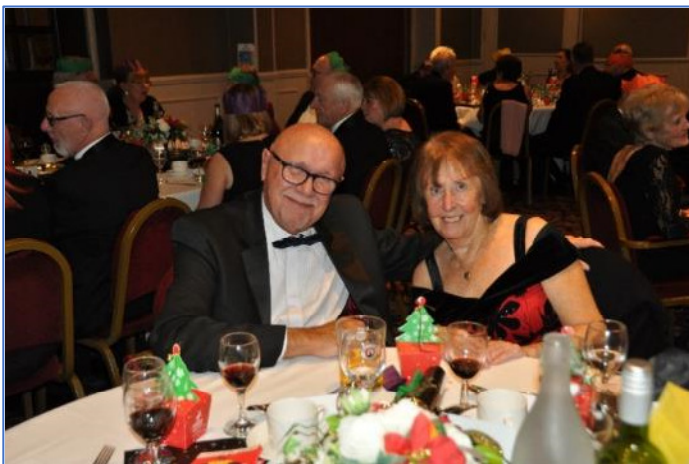
We were entertained by Alan Lovell of the Swinging Blue Jeans who got us all up dancing.